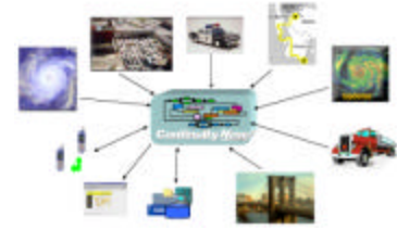
A Highly Complex Operating Environment